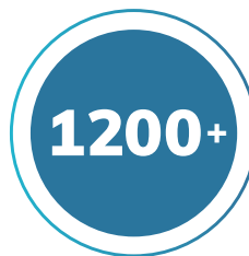
actions and tasks to automate