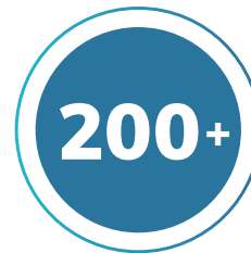
plugins to integrate your tools